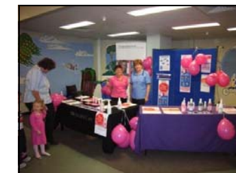
Hand Hygiene display at The Canberra Hospital, ACT

There was also media and print coverage about the day with a number of metropolitan, regional and rural newspapers printing