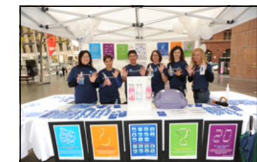
Clinical Excellence Commission, Sydney staff at the stall in Martin Place

Australia used the day to promote the National Hand Hygiene Initiative across the country. Each state and territory participated in the event with hospitals and area health services putting on a range of activities such as BBQs, foyer displays, giving