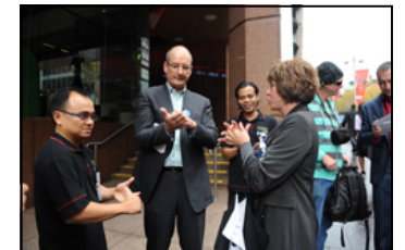
David Koch and Natalie Barr from the Sunrise breakfast TV program learn how to use alcohol based hand rub