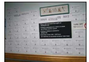
Hand Hygiene online learning participation certificates of staff at the Royal Hospital for Women, Sydney

We would like to thank all the hospitals, areas health services and departments of health who participated in this global event to raise awareness and spread the word on the importance of hand hygiene.