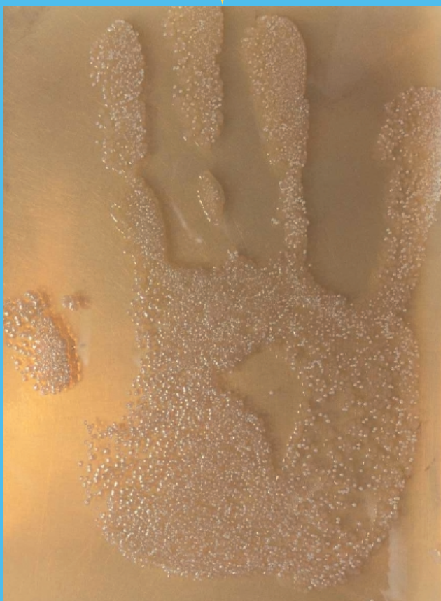
Hands decontaminated by a 30 second handwash with Chlorhexidine Gluonate 2% - Microshield 2 Green solution