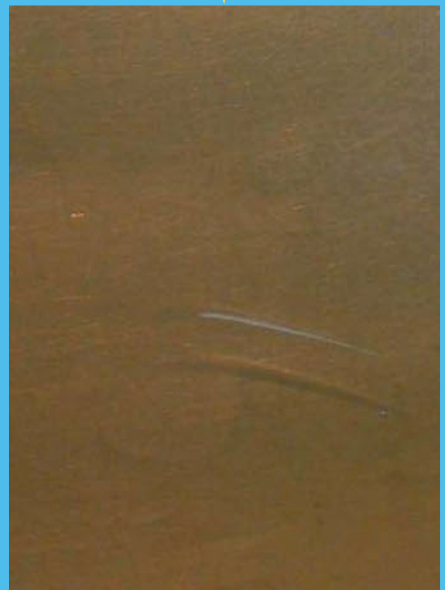
Hands decontaminated by a 15 second application of Ethanol 61.5% - Microshield Antimicrobial Hand Gel